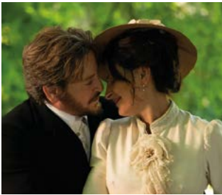
© Carole Beffuel - 2023 Curiosa Films

3 Nov, 11.00 & 18.15 | 4 Nov, 17.45 5 Nov, 17.35 | 6 Nov, 20.35 8 Nov, 15.45 | 11 Nov, 11.15