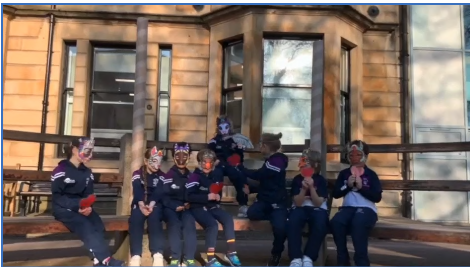
Music video by Glasgow Academy Primary School