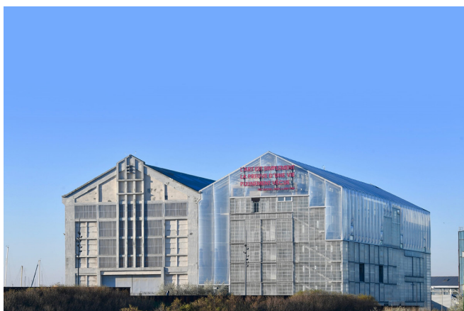
FRAC Grand Large, Dunkirk, Hauts-de-France