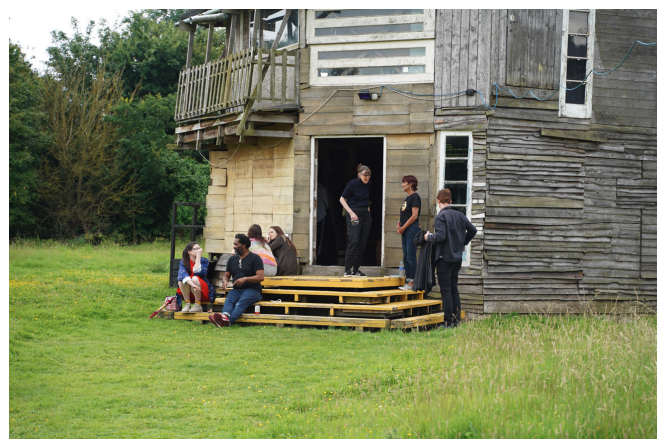
Wysing Art Centre, Cambridge, England